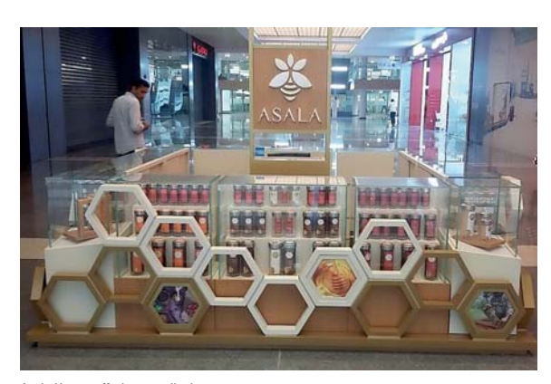
Asala Honey offerings on display.